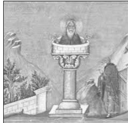
This is Saint Daniel, who lived up on top of a tall pole like this.

Have you ever tried to get attention? Maybe, when you were little? Well, getting attention usually isn't so great, you know. But this week we celebrate the nameday of a saint who got lots of attention. He used that attention to tell people about God. He used it to give advice to people who needed it.