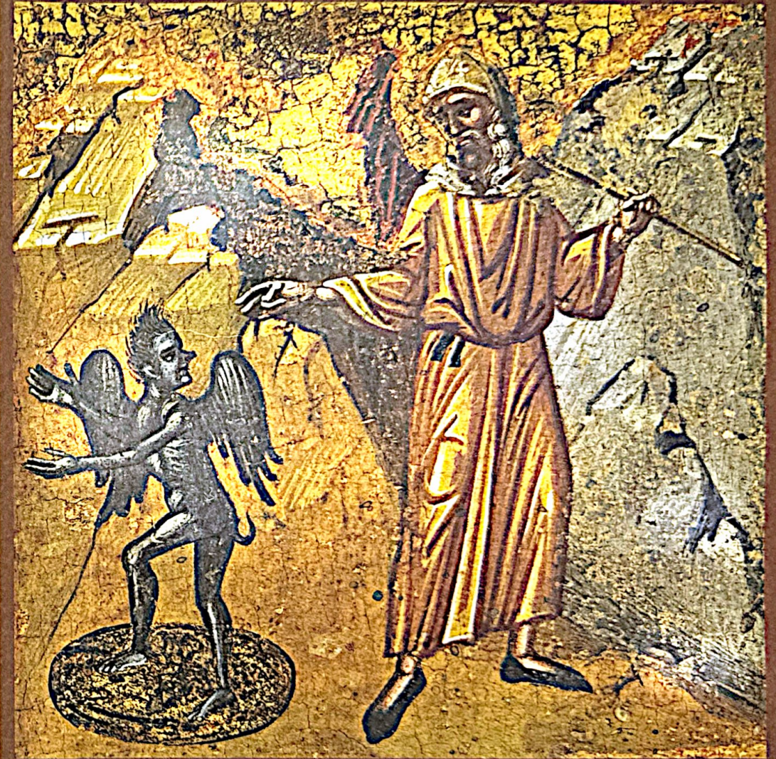
St. Anthony the Great struggles with the devil in the desert

The Orthodox Weekly Bulletin . . . . . Vestal, Cliffwood, New Jersey . . . . . Litho in U.S.A.