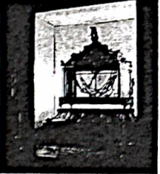
You can still pray in front of the chains of St. Peter if you go to a church in Rome, Italy.

We celebrate this miracle on Tues., January 16th (OC: January 29th).